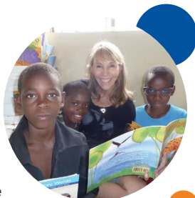
Africa Hope Fund Reading Centre

The Star of Hope Centre in Kenya provides a home and education for approximately 30 orphaned children, while also serving 180+ children from the neighboring village with daily meals and five-day-a-week schooling. With our $1,600 grant, the school will be able to add a new classroom, expanding its offerings to include 9th grade, ensuring more students continue their education and build a brighter future.